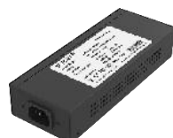
LAS60-57CN-RJ45 Hi-PoE midspan