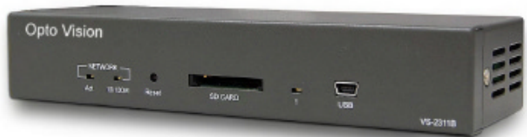
VS - 2311BE